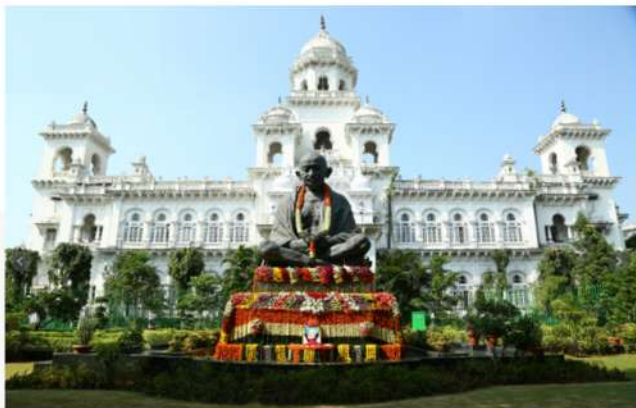
Telangana Assembly Building, Hyderabad)

State Health Minister of Telangana, Eatala Rajender has committed to take steps to promote Ayush systems of healthcare and to ensure the availability of Ayush medicines that help in disease prevention, as reported by THE TIMES OF INDIA on 4 th October 2020. This decision came during a detailed review of the functioning of the Health Department and all its wing conducted by the minister during which he also focused on Ayush system of medicines and related topics.