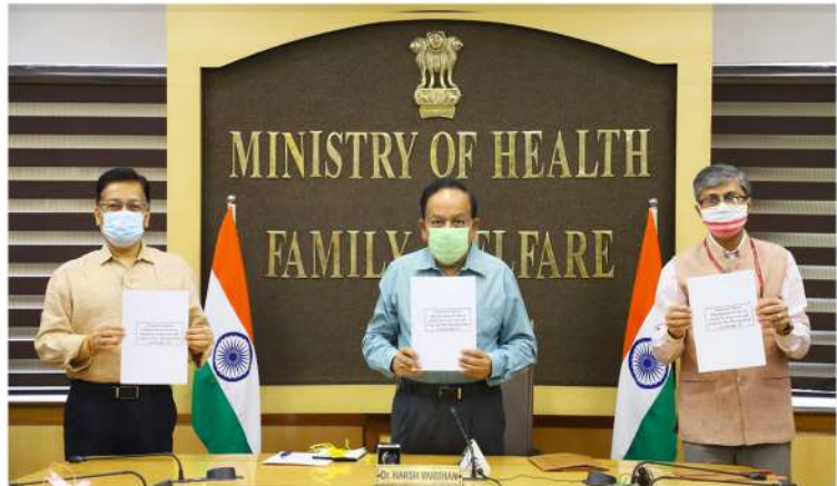
Dr. Harsh Vardhan, Union Minister for Health and Family Welfare releases the National Clinical Management Protocol based on Ayurveda and Yoga for the management of Covid-19 in an e-event at New Delhi on 6th October 2020. Shri Shripad Yesso Naik, Union AYUSH Minister joined the event virtually from Goa.

augment the standard preventive measures for Covid-19. (The standard preventive measures are those provided in the guidelines issued by the Ministry of Health and Family Welfare). Taking note of this potential of Ayurveda and Yoga, expert committees from the concerned National Institutes and Central Councils for Research Centres along with a few other noted research institutions have collaborated and developed a protocol for the management of Covid-19.